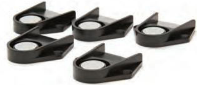
HI920005 Tag holders with tags (5)

Install tags near your sampling points for quick and easy iButton® readings. Each tag contains a computer chip with a unique identification code encased in stainless steel. You can install a practically unlimited amount of tags.