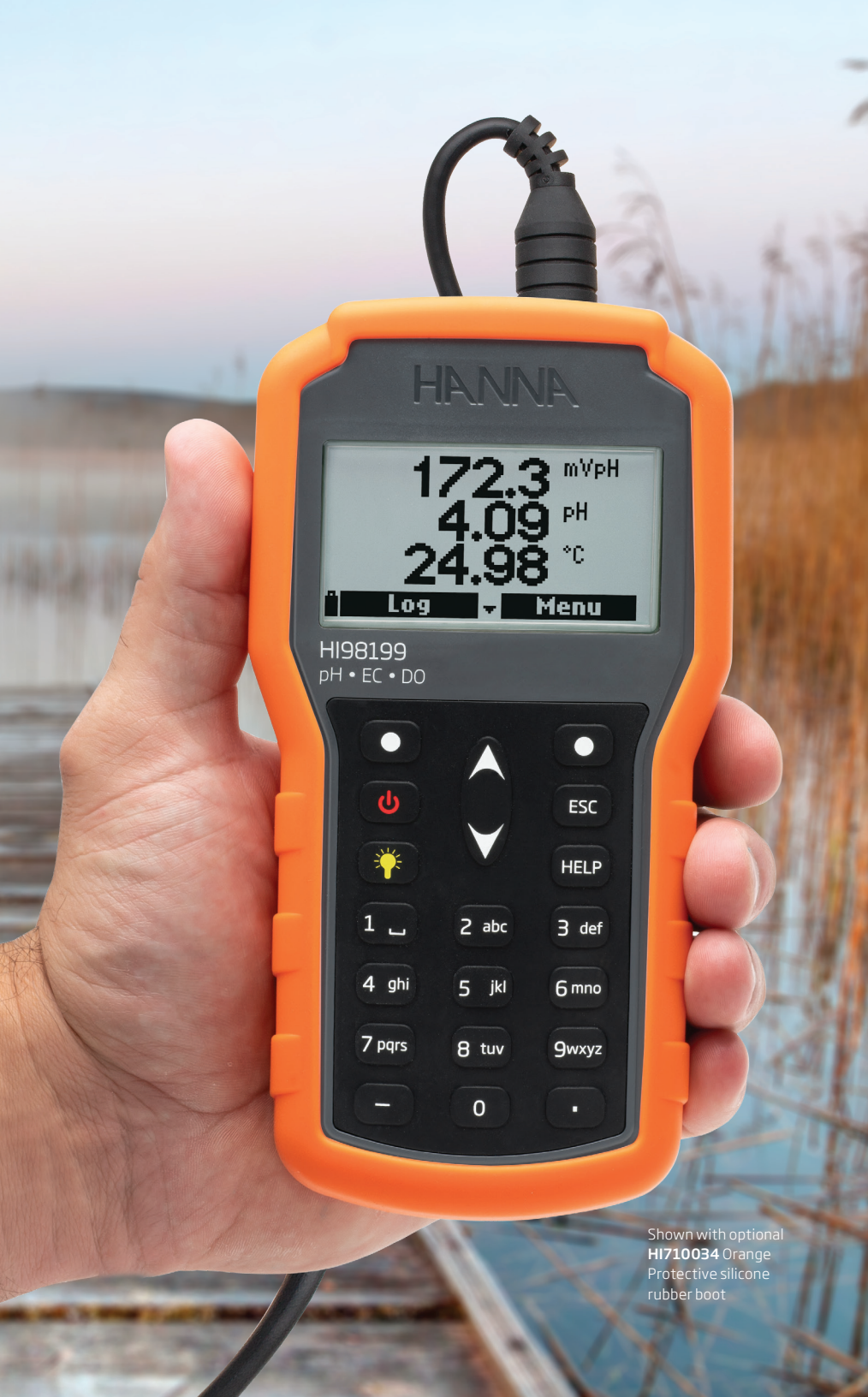
Shown with optional HI710034 Orange Protective silicone rubber boot